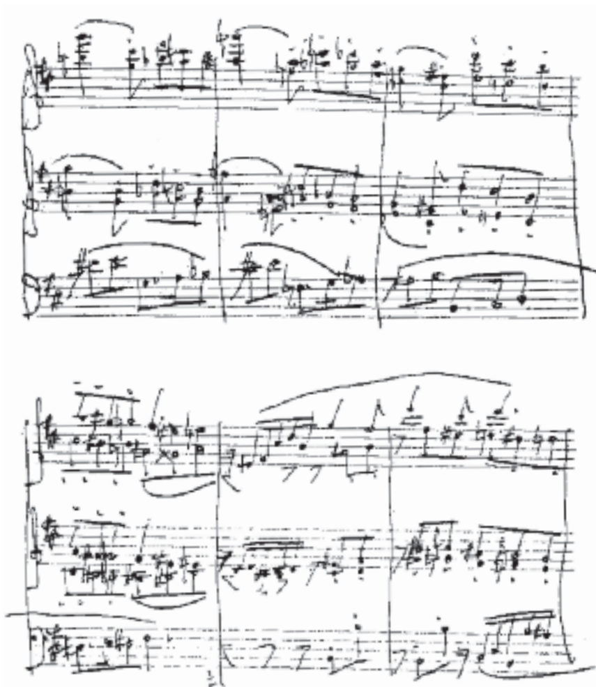
Vierne's autograph of measures 5-10 of the Allegro risoluto of Symphonie VI

renowned Saint Thomas Choir of Men and Boys. In 2007, he was awarded an Honorary Doctorate from Nashotah House Seminary in Wisconsin.