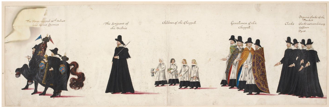
The choristers and gentlemen appearing on an illustration of Queen Elizabeth I's Funeral Procession

During the time of King Henry VI, the choir had grown larger. In 1455, the Chapel Royal consisted of one Dean, 20 Chaplains and Clerks, seven Children, one Chaplain Confessor for the household, and one Yeoman. However, the clerks petitioned the King asking that their number be increased to 24 singing men, due to "the grete labour that thei have daily in your chapel".