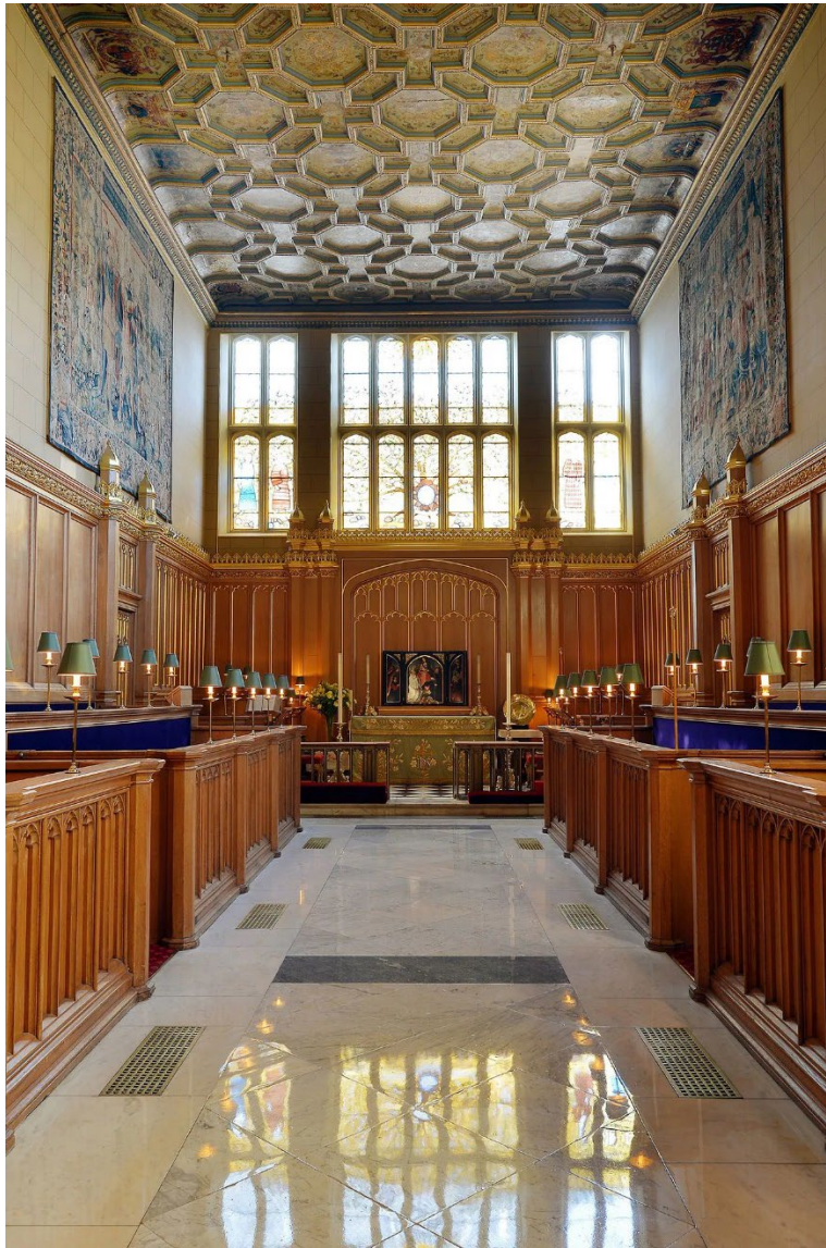
The Chapel Royal at St. James's Palace, London, with its ceiling painted by Holbein.

U NLIKE Westminster, that still has a choir school exactly like ours at Saint Thomas, the boys of the other choirs are educated at different schools; the choristers of the Chapel Royal at the City of London School, the boys of the Savoy Chapel at St. Olave's Grammar School, Orpington, and the boys of the Chapel Royal at Hampton Court Palace are drawn from a number of local state and independent schools. St. George's Chapel, Windsor, is also a Chapel Royal but has a very different relationship to the London Chapels. There are also three Chapels Royal in Canada where, of course, King Charles is Head of State.